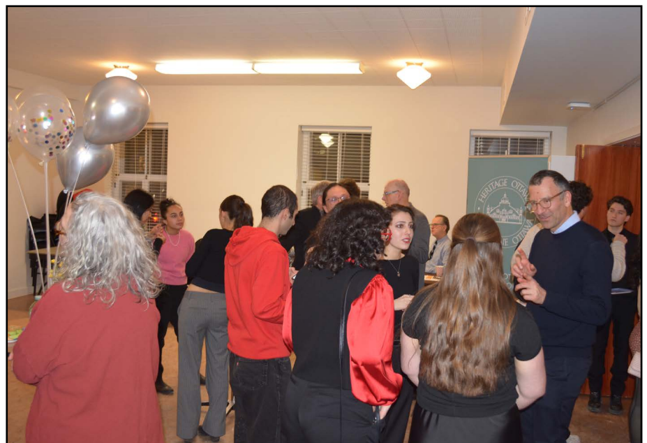
The SSAC and HO social evening

This particular event encouraged students, especially those new to the university, to step out of their comfort zones and engage in conversation, learning and find common ground across generations. The funds raised from this fundraiser made student-driven events more possible going forward. Heritage Ottawa's presence