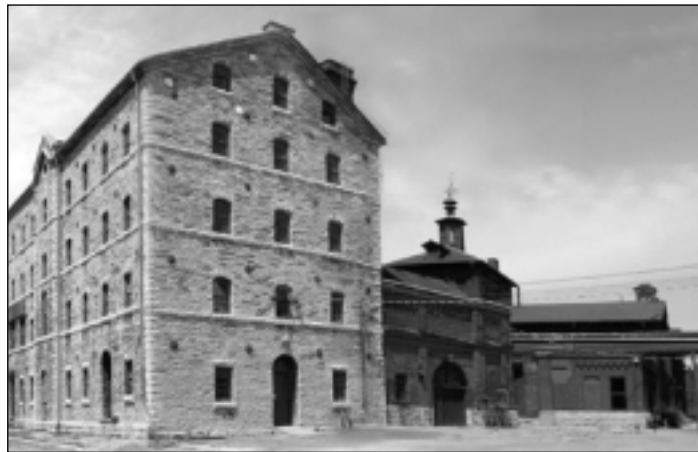
Gooderham & Worts Distillery, Toronto, circa 1840.