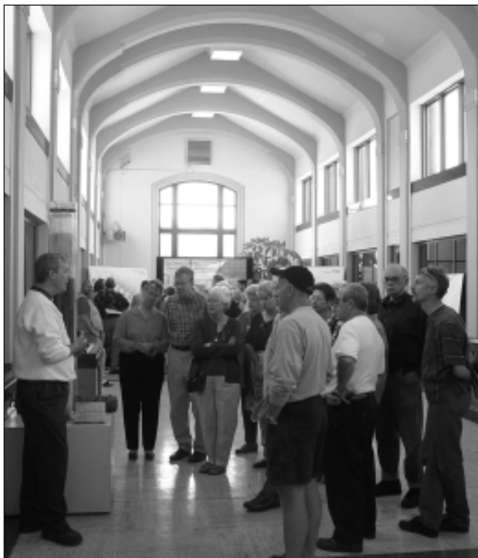
Cathedral like interior of control floor of Water Filtration Plant - Lemieux Island.