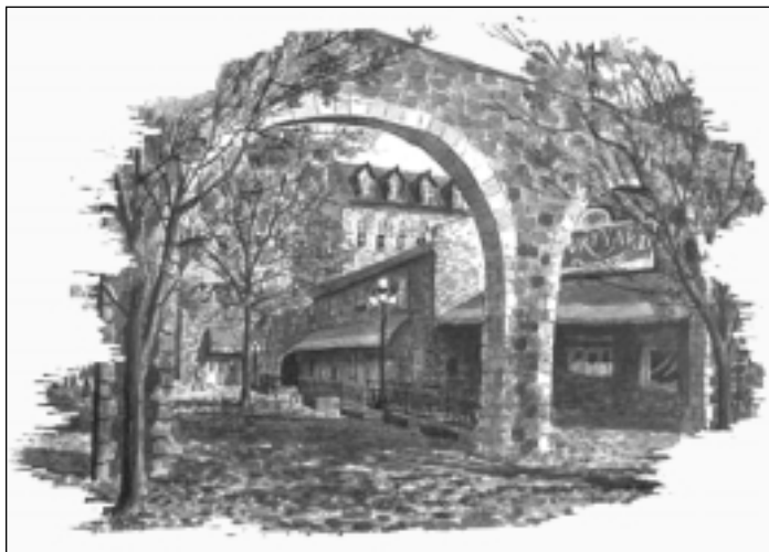
Courtyard Restaurant sketch taken from their web site home page.