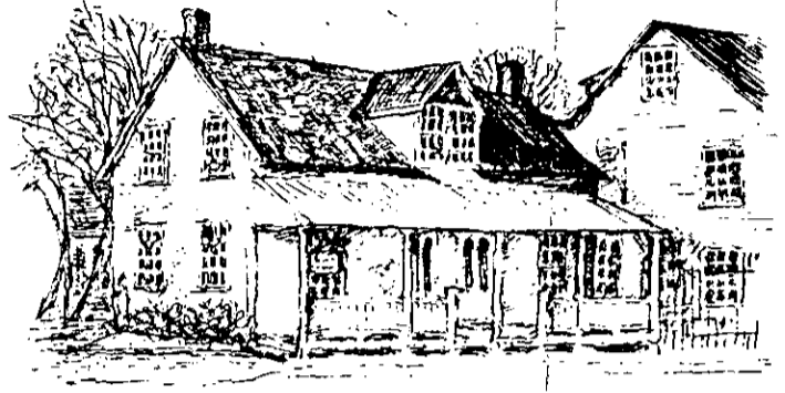
Heritage house in Wakefield

P.S. Compliments are not in order for VIA RAIL, which seems determined to sabotage the Wakefield Train run. They gave out contradictory information on times and places of departure, they told tour group members that the Heritage Ottawa tour had been cancelled a week previously, and they made no effort to block off seats so that our group could sit together.