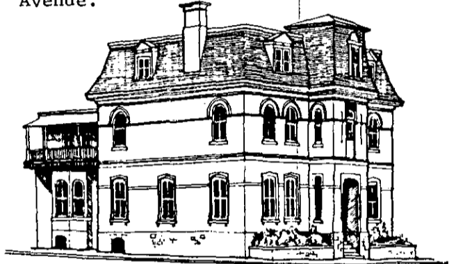
The Grant House (now Friday's Roast Beef House), drawn by Lyette Fortin