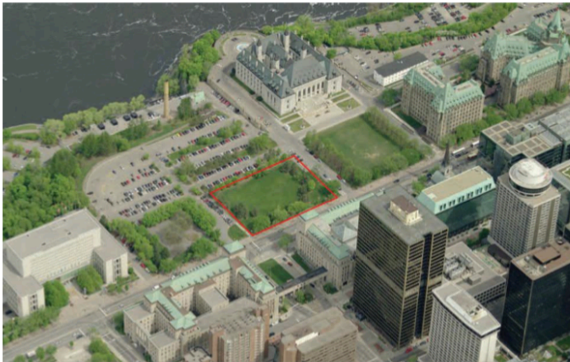
Air photo of site of proposed Memorial to Victims of Communism (Judicial Precinct)